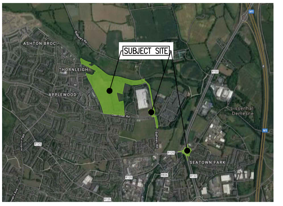
SITE LOCATION PLAN N.T.S.